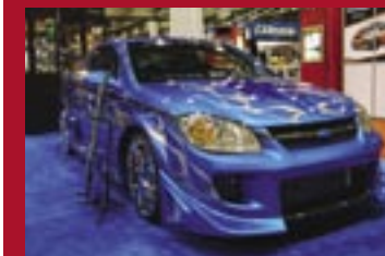
Kal Concepts / Air Syndicate Cobolt