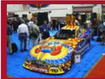
House of Kolor® drag car draws a crowd