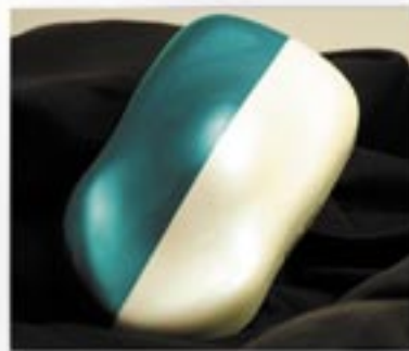
KOSMIC DRY PEARL KOP2007 TURQUOISE UNDERGLAZ BLACK & WHITE

House of Kolor® is pleased to introduce 6 exciting new products: