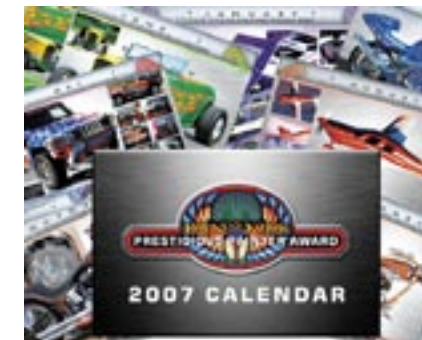
Prestigious Painter Calendar 2007